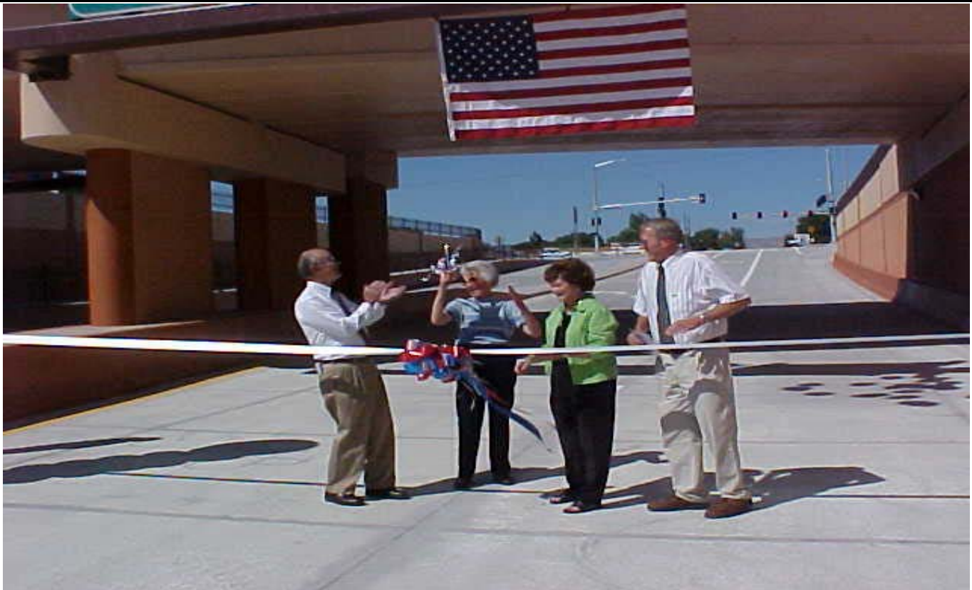
Grand Opening of the 30 Road Underpass