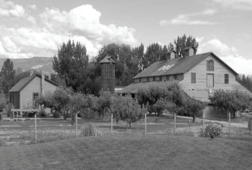
Cross Orchards Living History Farm

Action steps related to Economic Development, Land Use and the Main St. Project have been rolled into the Economic Development committee. The majority of the focus at this time is on the Old Town Clifton- Main Street Project.