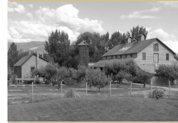
Cross Orchards Living History Farm