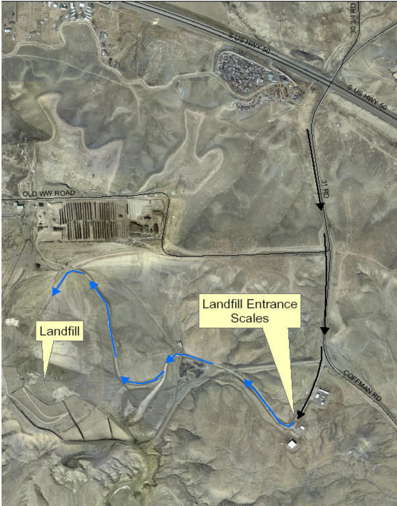
Figure 12. Mesa County Landfill Site