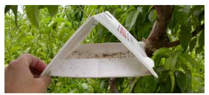
Fig. 5 Delta trap

• Delta or wing style pheromone traps can be used to monitor adult activity (Fig. 5).