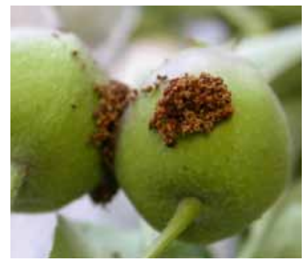
Fig. 4 Frass from codling moth exit